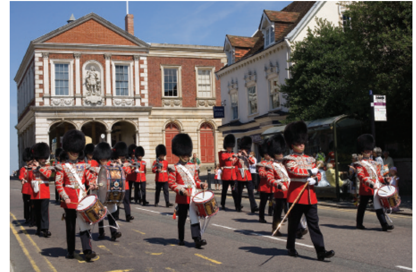
The band of the Coldstream Guards returns to barracks along Upper Thames Street after the changing of the Castle guard.