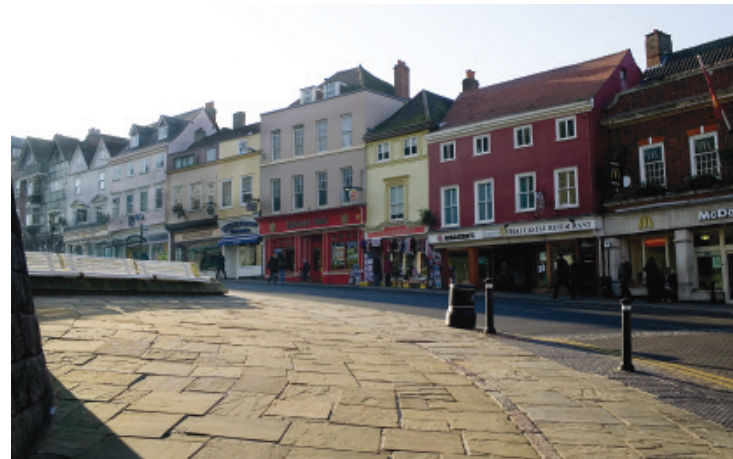
Above: Thames Street with its collection of ancient and modern properties climbs the hill towards the Castle entrance.