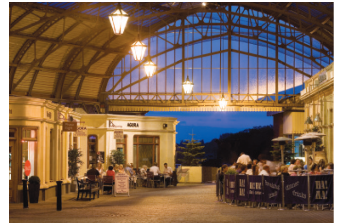
With only one active platform remaining the Windsor and Eton Central Station has become a centre for local nightlife.